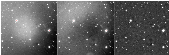
Figure 1. Field of variable star V1323 Her. From left to right: raw image, calibrated in usual way with the Muniwin, calibrated with a new FrameSmooth software

The CoLiTex group developed also a new tool for the calibration of astronomical